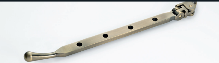
10" working and dummy stays available