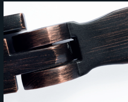
Bronze Red Tint