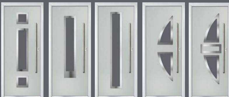
Inox Lyon Page 52