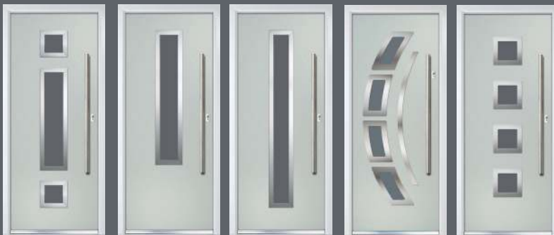
Urban Vilamoura Page 47