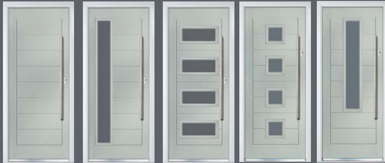
Monza II Solid Page 36

A selection of styles using a non-moulded, woodgrain door blank or smooth/etched LINKS blank which perfectly replicates aluminium. With a wide selection of glass options our contemporary doors are glazed using the TriSYS cassette system as standard. For a more modern look, choose our Urban or Inox doors using either the Urban aluminium cassette or the stunning Inox stainless steel frames.